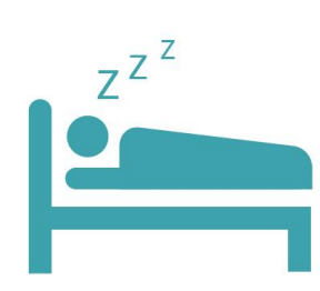
3. Get plenty of sleep.